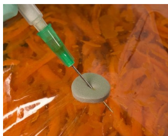
Septum perforated by a hollow needle.

The costs: Currently, all methods to analyse O 2 or CO 2 or to leak test flexible packaging require that you use a septum, which you have to manually adhere to the packaging, and then manually perforate the septum with a hollow needle to perform the leak test.